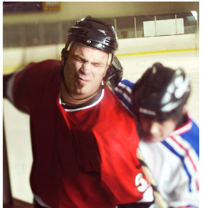
Less risk for concussions thanks to flexing sheets.