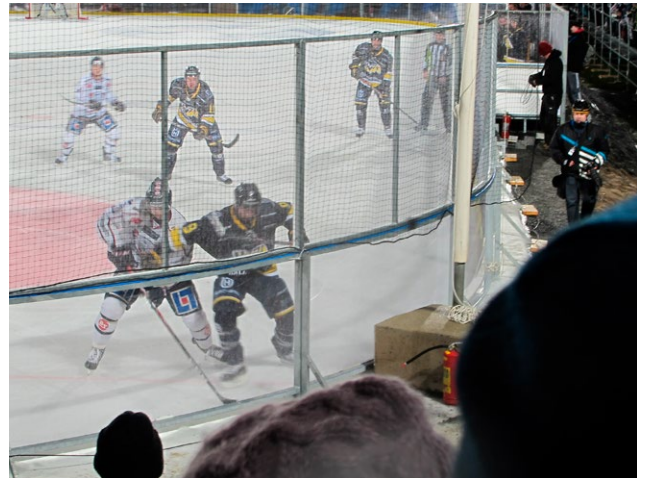
Visibility all the way down to the ice, gives a better visual and media experience.

Polycarbonate sheets themselves are virtually unbreakable. By adding a hard top coating the sheet obtains a good protection against abrasion and chemicals. We only use sheets with excellent clarity and good optical properties for our SAPHIR® range.