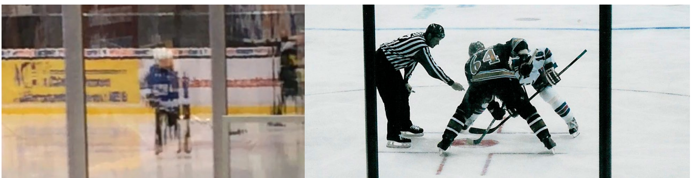
There is a difference between sheet qualities. With SAPHIR® sheets high optical properties are guaranteed.