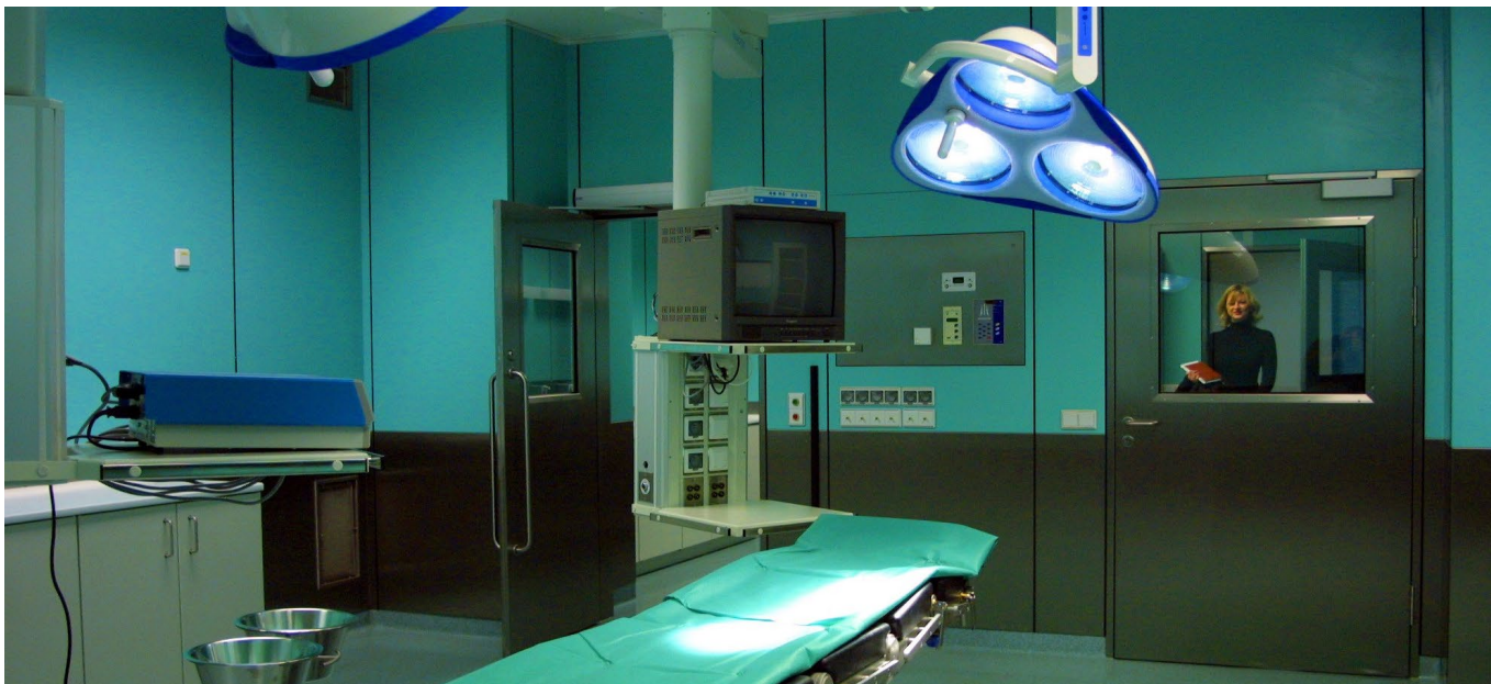
Hospital environment. The constant moving of medical equipment or beds brings frequent impact and wear to the walls.