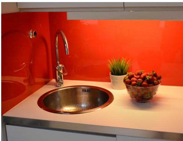
In kitchens, Makrotech™ offers a smooth, water resistant surface that is easy to keep clean.