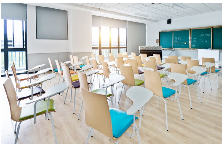
Makrotech is a robust protection in lower part of walls in public buildings or schools.