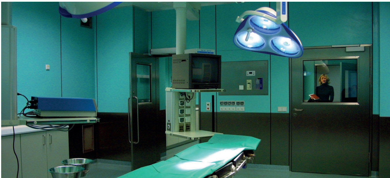
Hospital environment. The constant moving of medical equipment or beds brings frequent impact and wear to the walls.