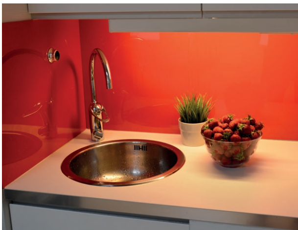
In kitchens, POLYCARBONATE OPAQUE ATECH® 7000 offers a smooth, water resistant surface that is easy to keep clean.