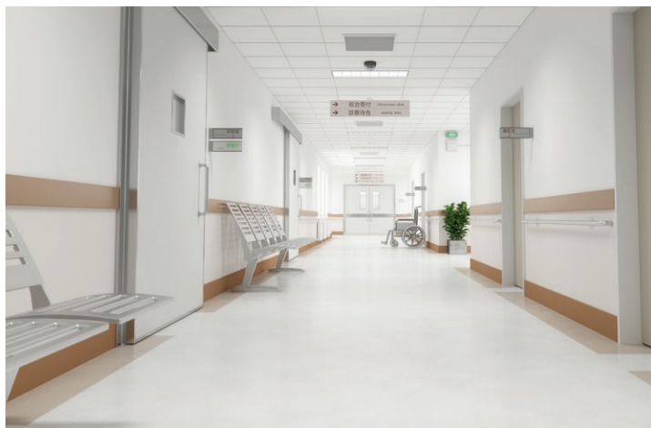
In corridors with a lot of traffic, the walls and corners quickly get worn down.