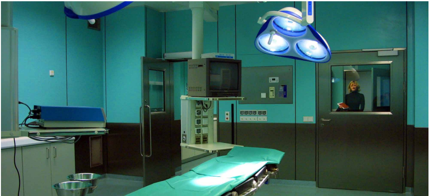
Hospital environment. The constant moving of medical equipment or beds brings frequent impact and wear to the walls.