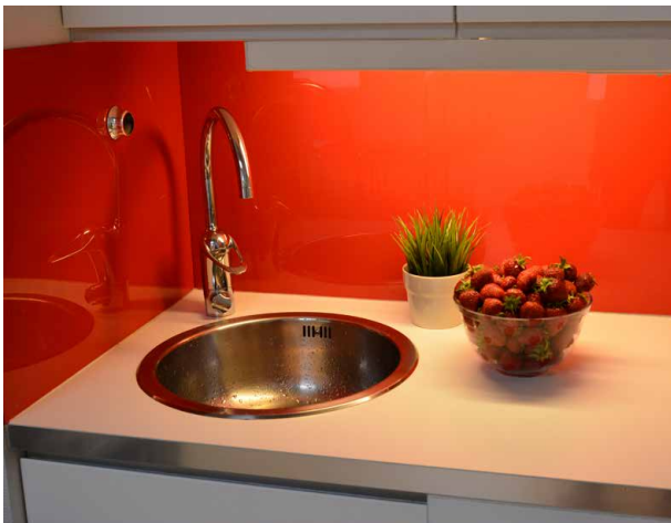
In kitchens, POLYCARBONATE OPAQUE ATECH 7000 offers a smooth, water resistant surface that is easy to keep clean.