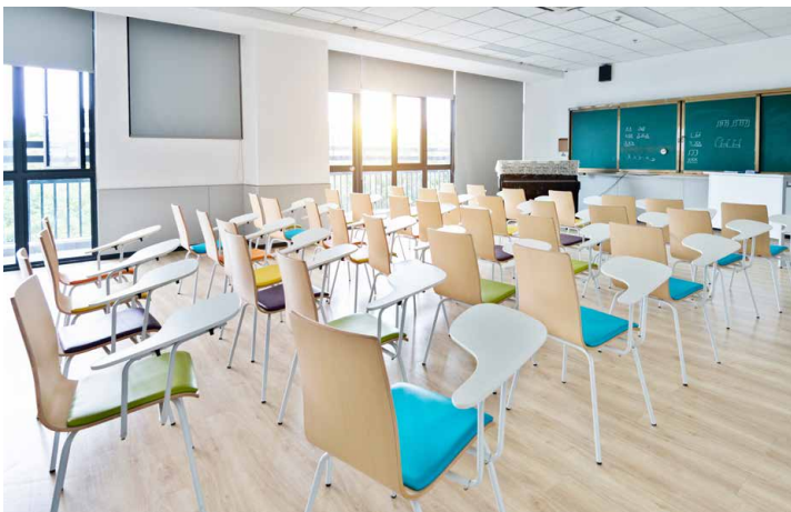
POLYCARBONATE OPAQUE ATECH 7000 is a robust protection in lower part of walls in public buildings or schools.