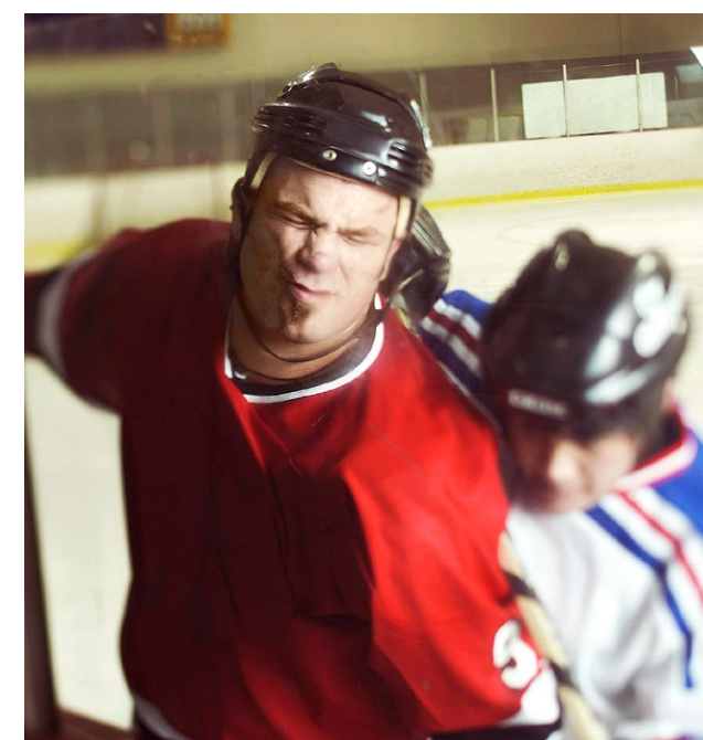
Less risk for concussions thanks to flexing sheets.