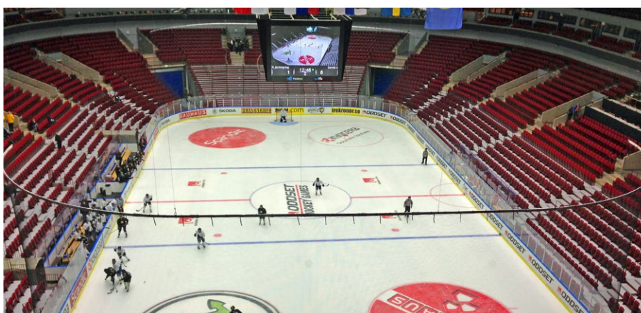
Malmö arena, Malmö, Sweden