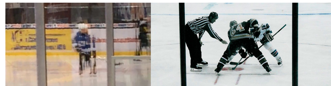
There is a difference between sheet qualities. With SAPHIR® sheets high optical properties are guaranteed.