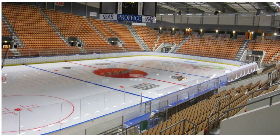
COOP arena, Luleå, Sweden