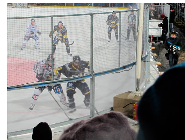
Visibility all the way down to the ice, gives a better visual and media experience.

Polycarbonate sheets themselves are virtually unbreakable. By adding a hard top coating the sheet obtains a good protection against abrasion and chemicals. We only use sheets with excellent clarity and good optical properties for our SAPHIR® range.